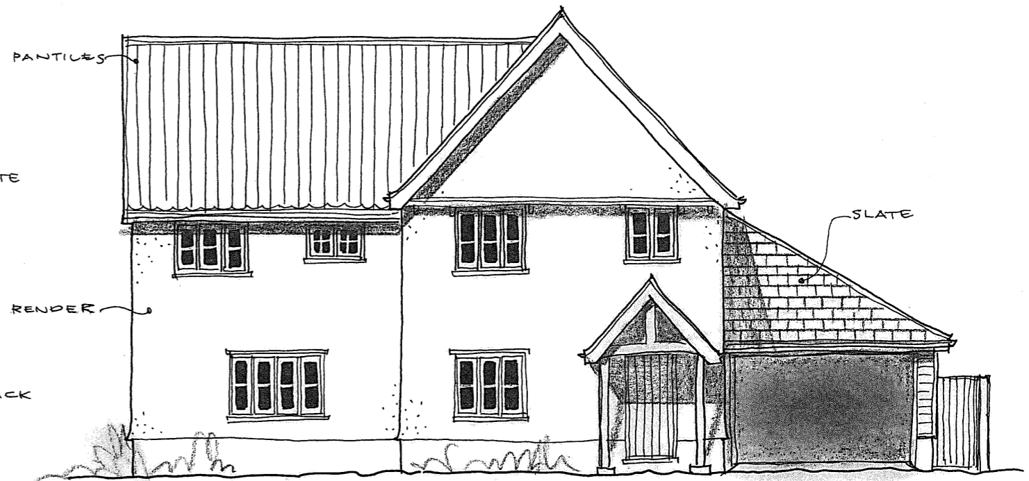
PLOT 2 EAST ELEVATION ~