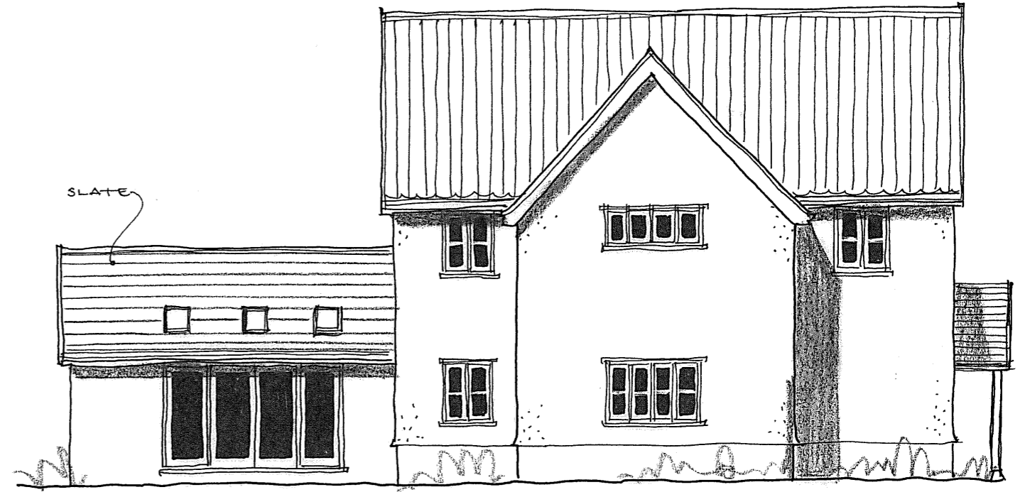
SOUTH ELEVATION ~