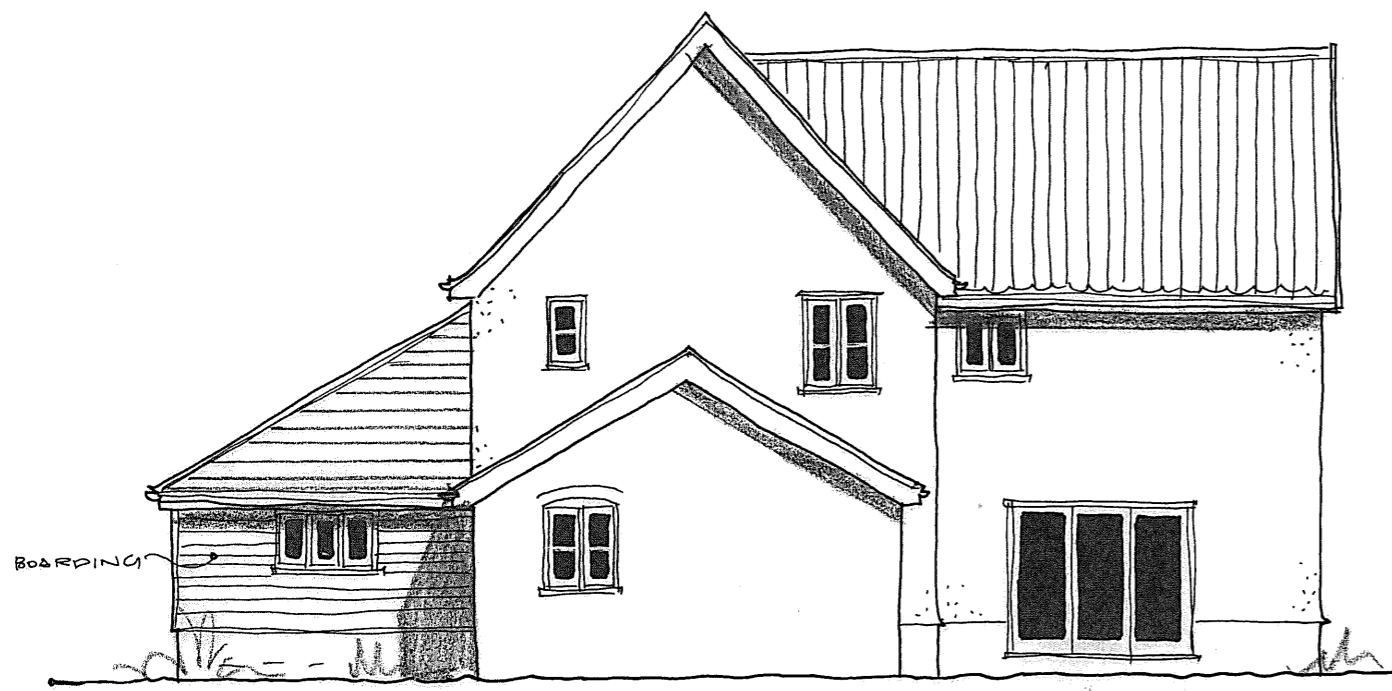
WEST ELEVATION ~