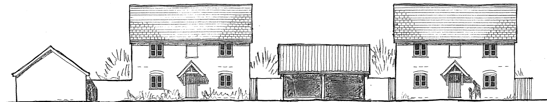
SOUTH ELEVATION - PLOTS 4 & 3