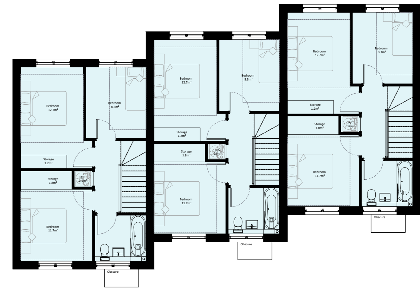
PLOTS 1-3 FIRST FLOOR