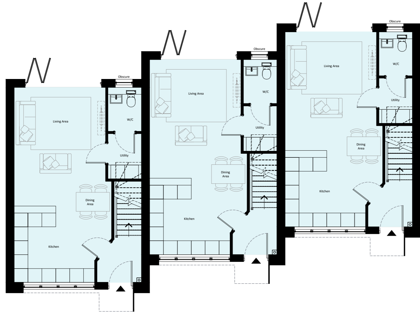
PLOTS 1-3 GROUND FLOOR 93.1m 2 (1,002sq.ft) 2 Storeys, 3 Bedroom, 5 Persons

Unless otherwise stated, all dimensions are in mm.