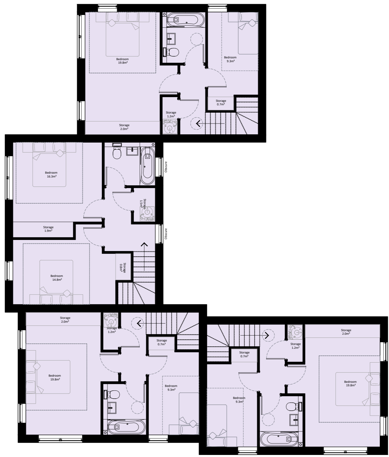
PLOTS 6-9 FIRST FLOOR