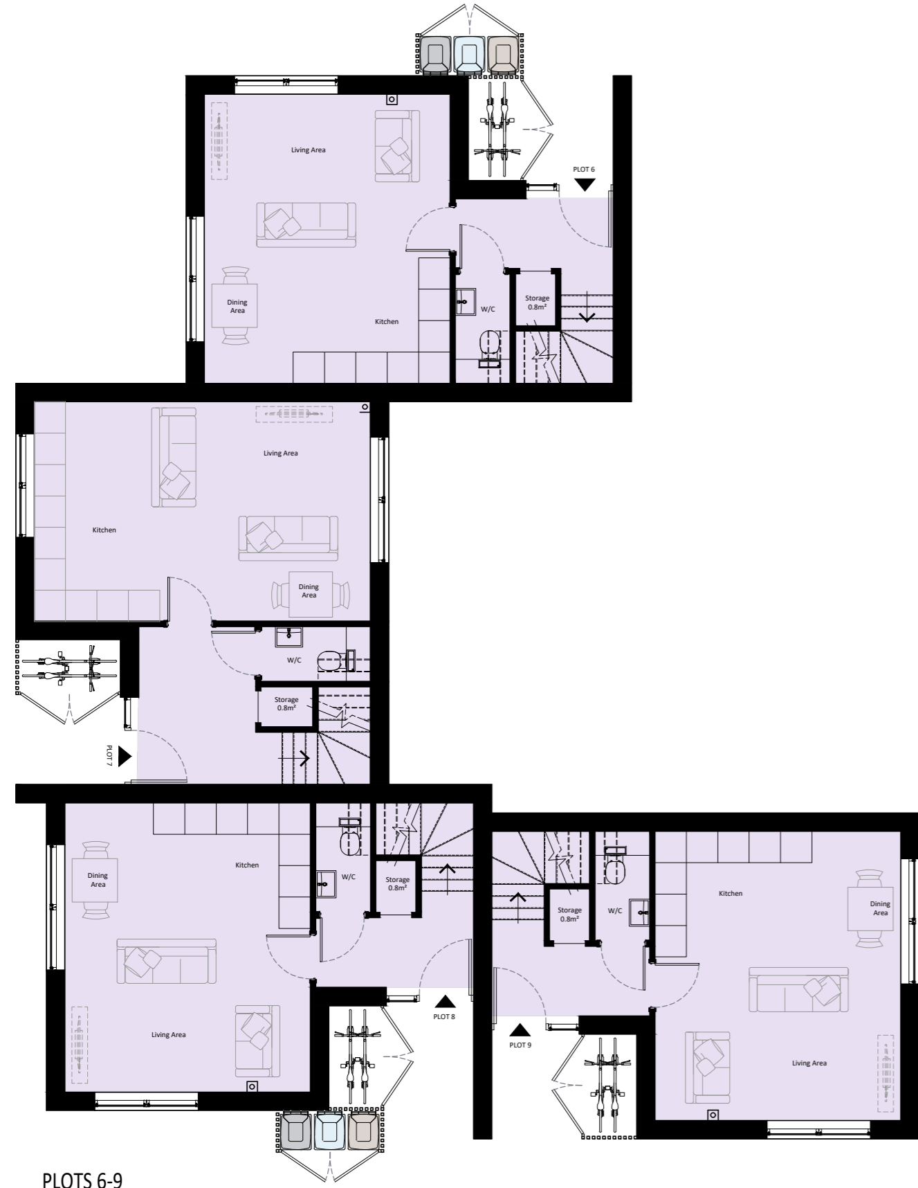
PLOTS 6-9 GROUND FLOOR Plot 6- 80.1m 2 (862 sq.ft) 2 Storeys, 2 Bedrooms, 3 Persons Plot 7- 87.7m 2 (944 sq.ft) 2 Storeys, 2 Bedrooms, 4 Persons Plot 8- 80.1m 2 (862 sq.ft) 2 Storeys, 2 Bedrooms, 3 Persons Plot 9- 80.1m 2 (862 sq.ft) 2 Storeys, 2 Bedrooms, 3 Persons

Unless otherwise stated, all dimensions are in mm.